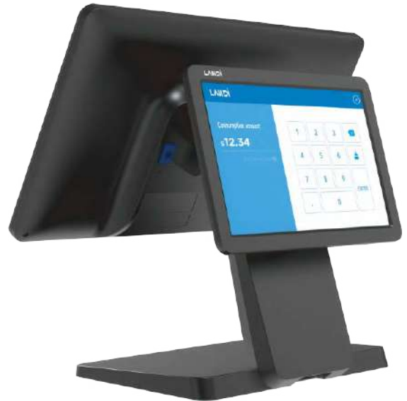
*Dual screen configuration shown.